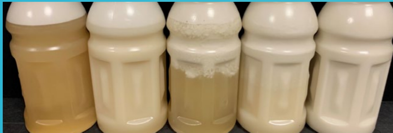
BOTTLE 1-4 : Infant formula samples with different degrees of product separation. Without the appropriate food additives, infant formula separates into lipid- (top) and water-soluble (bottom) fractions

Selection of additives for use is unique to the formula as their effects may vary depending on the product matrix. The most optimized additive is determined based on the manufacturing process (e.g. wet mix vs. dry blend), thermal processing method (e.g. retort batch sterilization vs. ultra-high temperature pasteurization), ingredients (e.g. intact vs. hydrolysed protein, type and level of lipids), and product format (e.g. powder vs. liquid). Figure 1 below demonstrates the varying suitability of a number of stabilizer additives on phase separation in liquid formula.